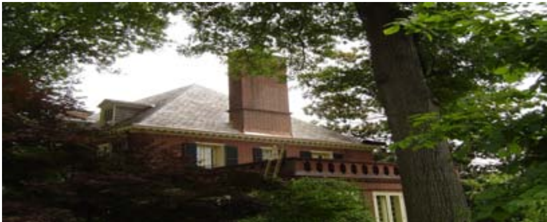
REPLACEMENT OF FLASHINGS MAKES AN OLD ROOF NEW AGAIN.